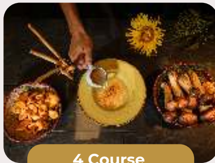
4 Course Lunch