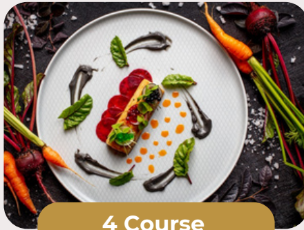
4 Course Lunch