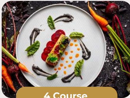
4 Course Lunch